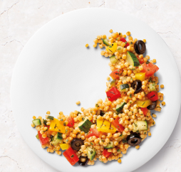
Sultan of Swing